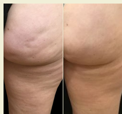
Avéli cellulite treatment

Avéli is the latest addition to our rapidly expanding treatment toolbox for cellulite. Conceived, developed, and perfected at SkinCare Physicians Avéli builds on the success of Cellfina in reducing the appearance of dimples on the buttocks and thighs. These two powerful dimple-busting technologies enable us to improve cellulite with incredibly long-lasting results. Studies indicate that we achieve meaningful improvement in cellulite dimples for 5 years or longer with one treatment. In addition to