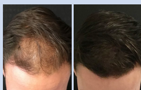
Before & after PRP treatment

Hair loss affects the confidence and self-esteem of many men and women. Over recent years, improved treatments help what is known as "patterned hair loss", stopping or even reversing hair loss in many patients. Topical minoxidil (Rogaine) and oral finasteride (Propecia) are approved to treat hair loss. In addition, dermatologists employ medications such as spironolactone and oral minoxidil as options for hair loss. They can be effective, but because of possible side effects, it is imperative to discuss these options with your dermatologist. When medications are not appropriate or preferred, platelet rich plasma (PRP) injections may stop hair loss and re-grow hair. During this procedure, a nurse draws a small amount of the patient's blood and re-injects growth-factor rich fluid into the scalp with the goal of stimulating hair follicles. Six treatments are done over a year followed by 1-3 maintenance treatments annually. We have seen success rates in up to 80% of our patients undergoing PRP.