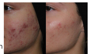
Before AviClear

Acne affects the vast majority of individuals, but some patients suffer from particularly difficult-to-treat acne. When medications have failed or can no longer be used, there is a new laser option available to our patients. AviClear is a laser device that targets acne at its source by suppressing sebum production from sebaceous glands. The treatment protocol consists of three monthly sessions. As a laser procedure, AviClear avoids the systemic side effects seen with oral medications, though it is an out-of-pocket procedure. When a good skin care routine and carefully chosen prescriptions are not successful, patients may be candidates for this highly effective laser treatment. Visit our dermatology providers to learn if AviClear is an option and to discuss the risks and benefits.