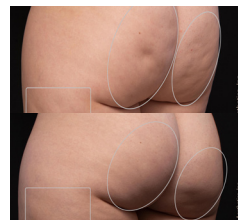
©2022 Revelle Aesthetics, Inc. Avéli cellulite treatment

We have pioneered a new generation of cellulite treatments, which can effectively smooth ripples and dimples. Avéli and Resonic were co-invented at SkinCare Physicians, and are the only cellulite procedures available with results that last many years. Resonic uses high-tech sound waves to tighten skin and eliminate the small fibrous bands under the skin that are the hallmark of cellulite. A single 60-minute non-invasive Resonic session improves the appearance of cellulite in over 90% of patients with zero recovery. Avéli uses a proprietary device to reach under the skin and find the fibrous bands, directly eliminating the source of cellulite with exquisite results. Dimples diminish, buttock shape improves, and skin looks smoother after this one-hour minimally invasive procedure. Recovery is rapid, and patients are thrilled with the outcomes. Additionally, Sculptra is a high-quality biostimulator injection that smoothes uneven cellulite dimples. A series of 2-3 treatments produce natural outcomes that can last for several years. Using this multi-modality approach, our physicians are the world's leading experts in cellulite therapy. Ask us how we might customize a simple treatment plan to help improve your skin.