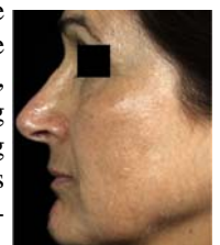
After 4 Treatments