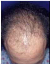
Pre Hair Transplant

•Hair transplants can be performed in a single session with completely natural results. The pluggy look is a thing of the past!