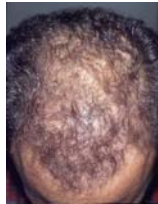
Post Hair Transplant

•SkinCare Physicians has a world class Clinical Research Center as part of our practice. Many of the exciting new technologies our patients use every day were studied and developed right here at SkinCare Physicians.